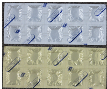
Lure package (rear)