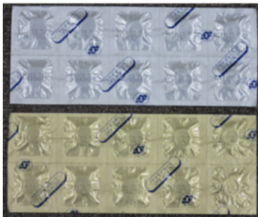
Lure package (front)